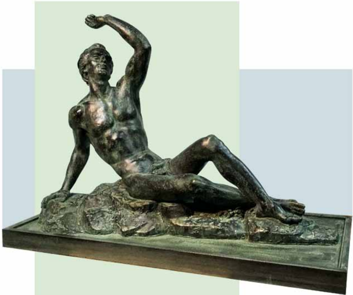
"THE MOUNTAIN MAN" _ Bronze (1975) _ 75 cm. _ Ed. 7 + 3 P/A _ Retail price: € 18.000 + VAT