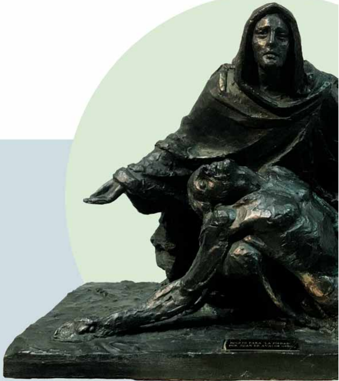
MONTE PARA LA FIDELIDAD POR JUAN DE AVILA 1991