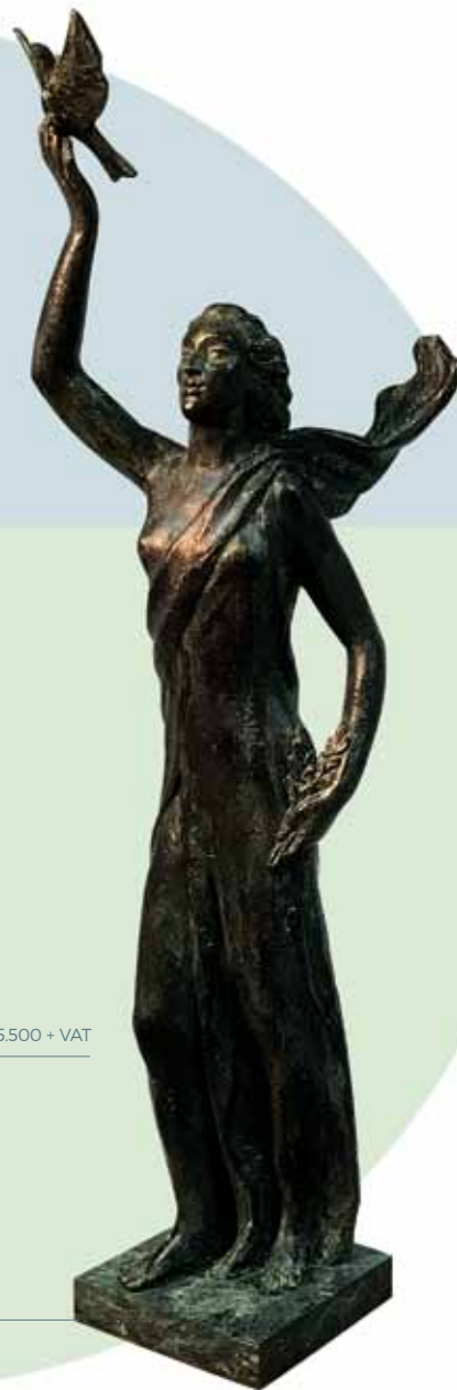
"PEACE. SKETCH OF MONUMENT TO THE ARMED FORCES IN BURGOS" Bronze (1983) _ 80 cm. _ Ed. 30 + 5 P/A _ Retail price: € 7.000 + VAT