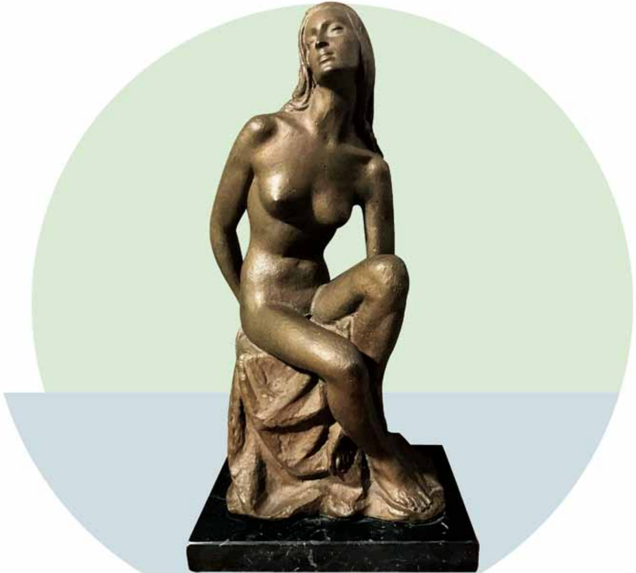
"AFTER THE BATH" _ Bronze (JAC) (about 1960) _ 75 cm. _ Without justifying edition _ Retail price: € 1300 + VAT