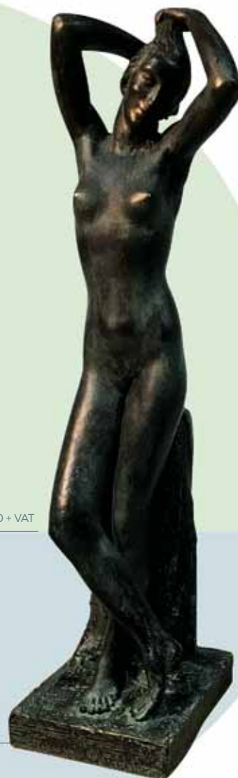
"THE COQUETTE" _ Bronze (1974) _ 75 cm. _ Ed. 30 + 5 P/A _ Retail price: € 5.000 + VAT