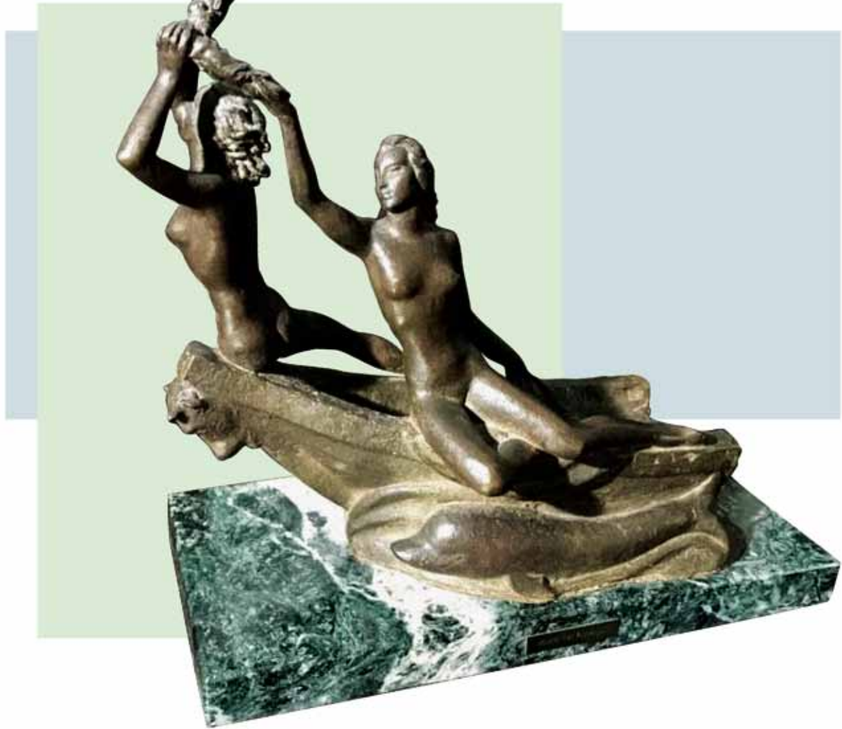
"THE BOAT" _ Bronze (JAC) (1974) _ 35 cm. _ Ed. 7 + 3 P/A _ Retail price: € 13.000 + VAT