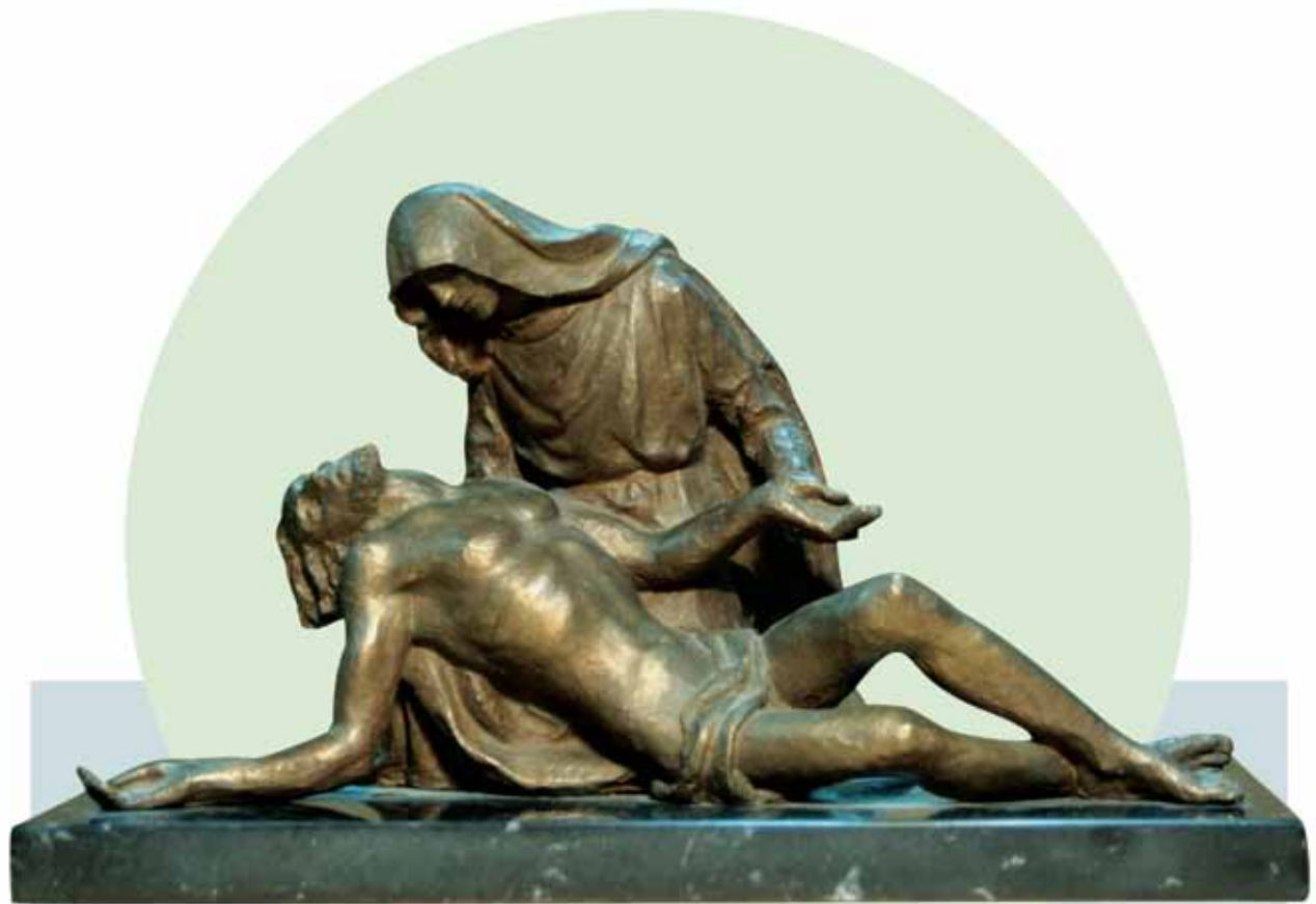
"PIETY" _ Bronze (JAC) (1951) _ 25 cm. _ Ed. 70 + 7 P/A _ Retail price: € 2.500 + VAT