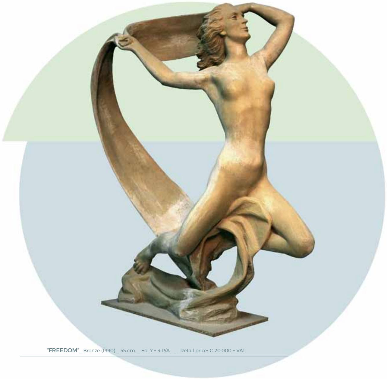
"FREEDOM" _ Bronze (1990) _ 55 cm. _ Ed. 7 + 3 P/A _ Retail price: € 20.000 + VAT