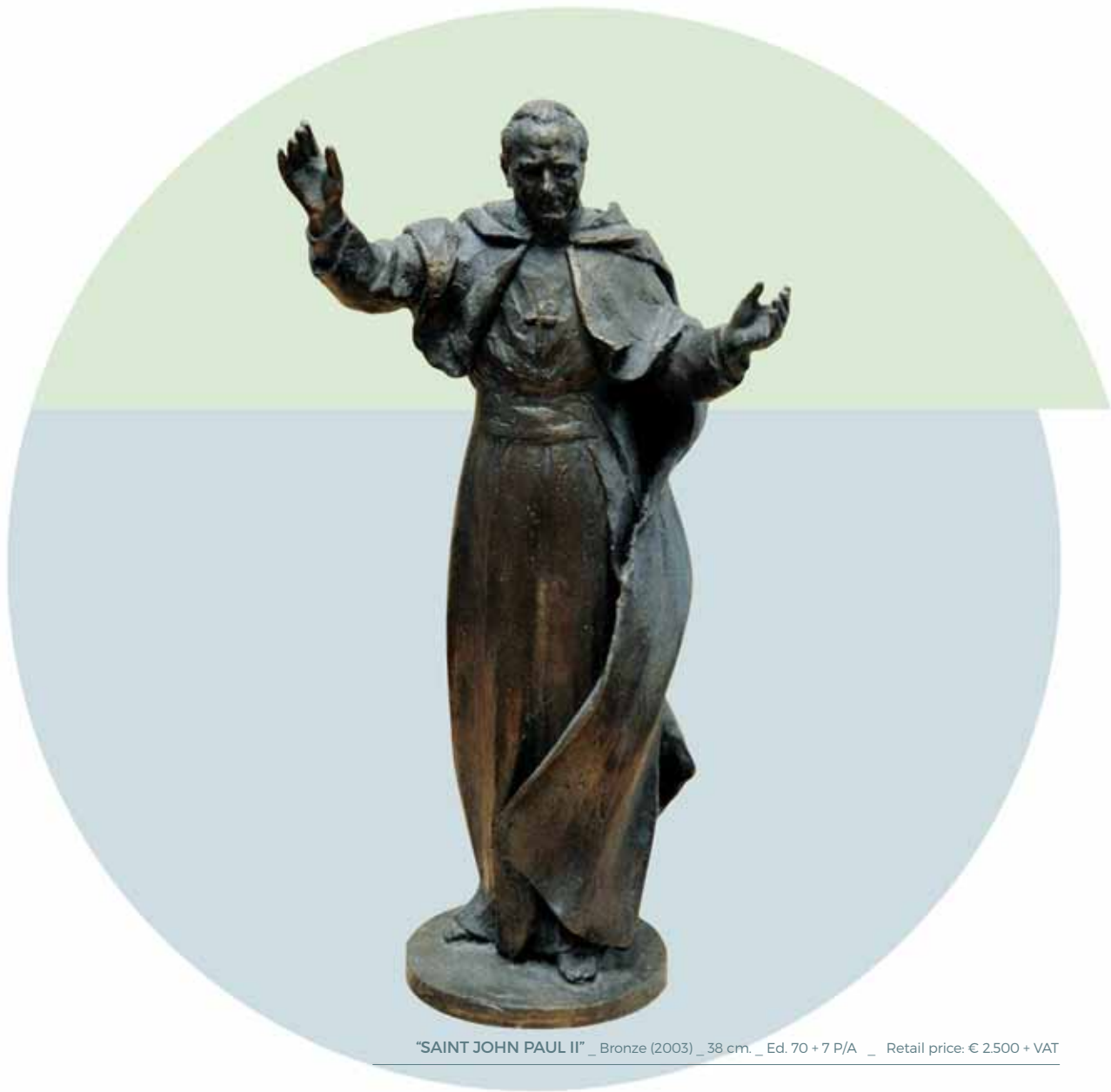
"SAINT JOHN PAUL II" _ Bronze (2003) _ 38 cm. _ Ed. 70 + 7 P/A _ Retail price: € 2.500 + VAT