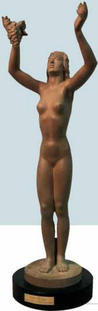
"THE WINE GODDESS"

Wood (JAC) (1996) _ 30 cm. _ Ed. 30 + 5 P/A _ Retail price: € 3.500 + VAT