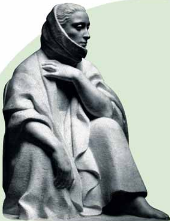
"NAZARÉ WOMAN" _ Bronze (JAC) (1945) _ 45 cm. _ With no limited edition _ Retail price: € 3.500 + VAT