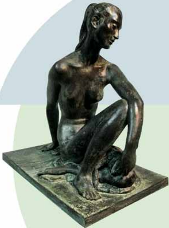
"SEATED WOMAN 2" _ Bronze (1991) _ 45 cm. _ Ed. 30 + 5 P/A _ Retail price: € 5.500 + VAT